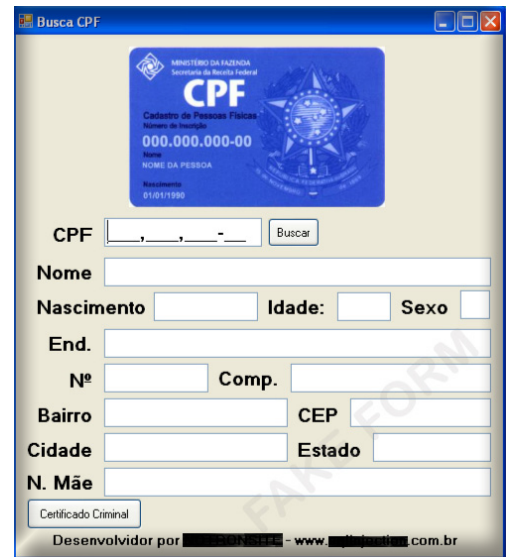
Figure 4. Malicious application's main window