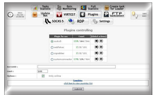
Figure 5. SpyEye Builder with cc grabber plug-in

Apart from the previously mentioned enhancements, the merged toolkit also had the customconnector plug-in, which tells the bot what command-and-control (C&C) server to communicate with, most probably for backup purposes. In previous versions, this was only part of a file named maincps.txt in the configuration file.