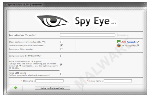
Figure 1. SpyEye Builder 1.3.05

A month after our security researchers found the merged toolkit version, they came across an updated version in the SpyEye Builder 1.3.X toolkit . This update came with three control panels in order to accommodate ZeuS and SpyEye's varying control panels.