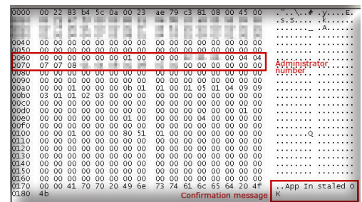
Figure 2. SMS sent to the bot master