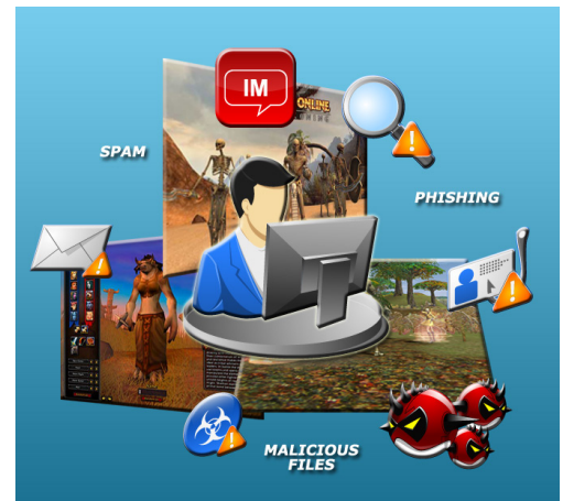
Figure 3. Threats online gamers face

This problem, however, is not without a solution. As in the "WoW" and PlayOnline incidents, online gamers must refrain from entertaining in-game messages with embedded links from unknown senders. They must especially be wary of clicking the said dubious-looking links. It will also help if they know the specific URLs of the legitimate sites related to their favorite games so they will not be easily tricked into clicking fake URLs.